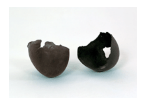
12. Without Title, 1969 Silver 1 ½ x 3 x 1 ½ inches