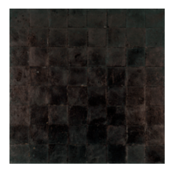
11. Without Title, 1990 Activated July 1990; photographed July 1998 Silver, varnish, gesso on linen 30 x 30 inches