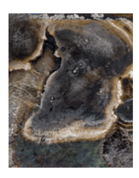
18. Jovian Dust Storm [Contingency Jet] , 2007 Activated September 2007; photographed 2008 Silver, liver of sulfur, tape, varnish, beeswax on paper 3 5/8 x 3 inches