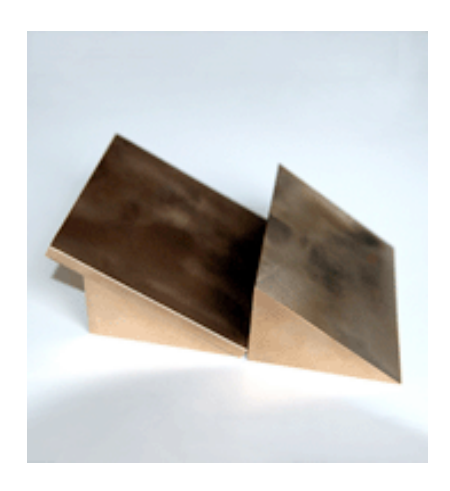
3. Variable II, 2006 Bronze 4 inch depth