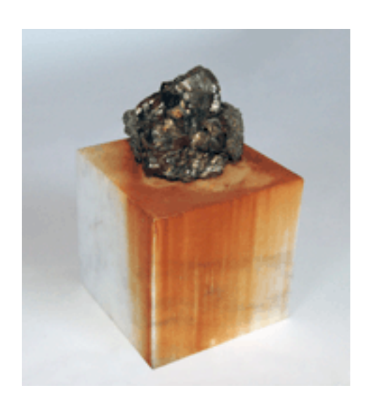
15. Indeterminacy , 1995 Activated September 1995; photographed September 2012 Vermont marble, pyrite 8 ½ x 6 x 6 inches