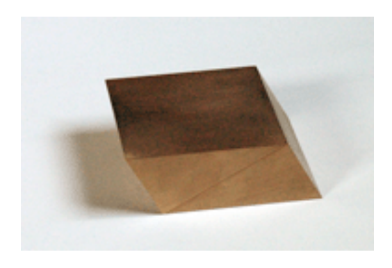
4. Libido , 2010 Bronze 1½ x 4½ x 4 inches