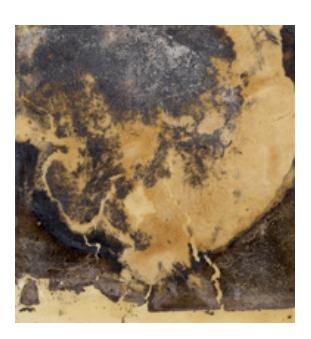
10. Contingency Jet [Eventual, Spoleto, Italy], 2003 Activated 2003; photographed July 2010 Silver, liver of sulfur, varnish, beeswax on paper 3 ½ x 3 ½ inches