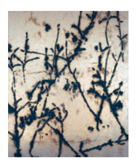
7. Contingency Poplar, 2011 Activated August 2011; photographed March 2012 Silver, liver of sulfur, varnish, gesso on linen 79 ¾ x 65 inches