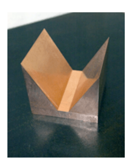
5. Variable II, 2006 Copper 4 inch depth