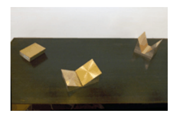
Libido, Variable I [brass], Variable II [copper]