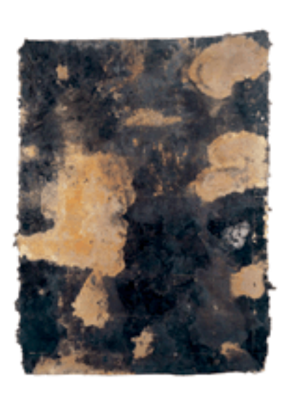
9. Contingency [1 of 12 selected by John Cage for his 1991 Carnegie International], 1985 Silver, aluminum leaf, liver of sulfur, varnish, gesso on handmade paper 32 x 24 inches