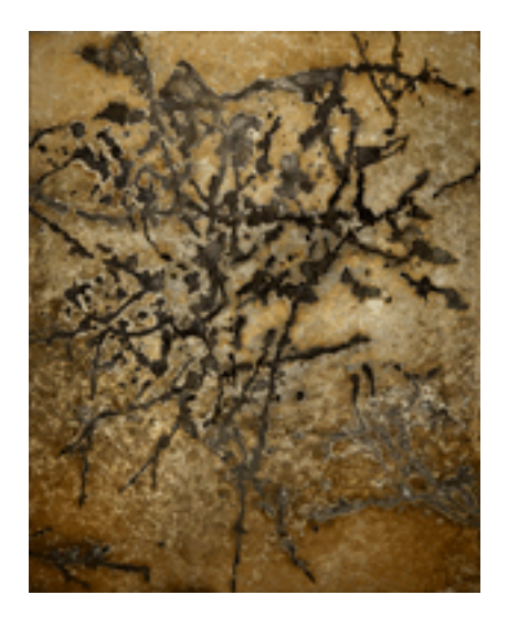
6. Contingency Roots and Leaves, 2012 Activated February 2012; photographed June 2012 Silver, liver of sulfur, varnish, gesso on linen 82 x 66 inches