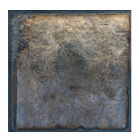
2. Without Title, 1995 Activated May 1995; photographed July1998 Silver, varnish on paper 3 ½ x 3 ½ inches