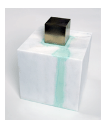
8. Notation XI, 2010 Activated and photographed April 2010 Vermont marble, bonze, ammonium chloride copper sulfate solution 10 \times 7 \frac{1}{2} \times 7 \frac{1}{2} inches